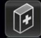
Medical Reference/ Decision Support