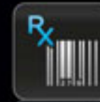
Medication Management/ Bar Coding