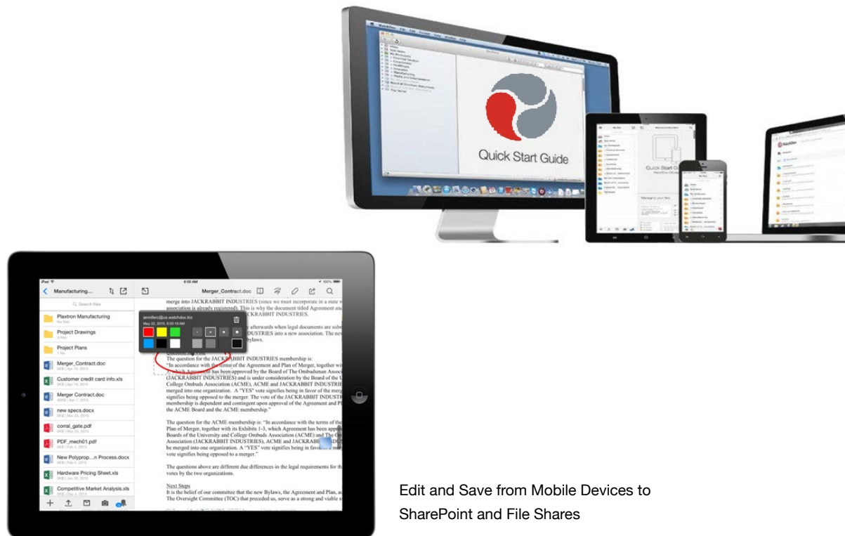
Edit and Save from Mobile Devices to SharePoint and File Shares

The same CFO can make annotations on the board presentation, and the financial analyst can make edits to the spreadsheet and save it back to SharePoint – all with safe and trusted tools from BlackBerry.